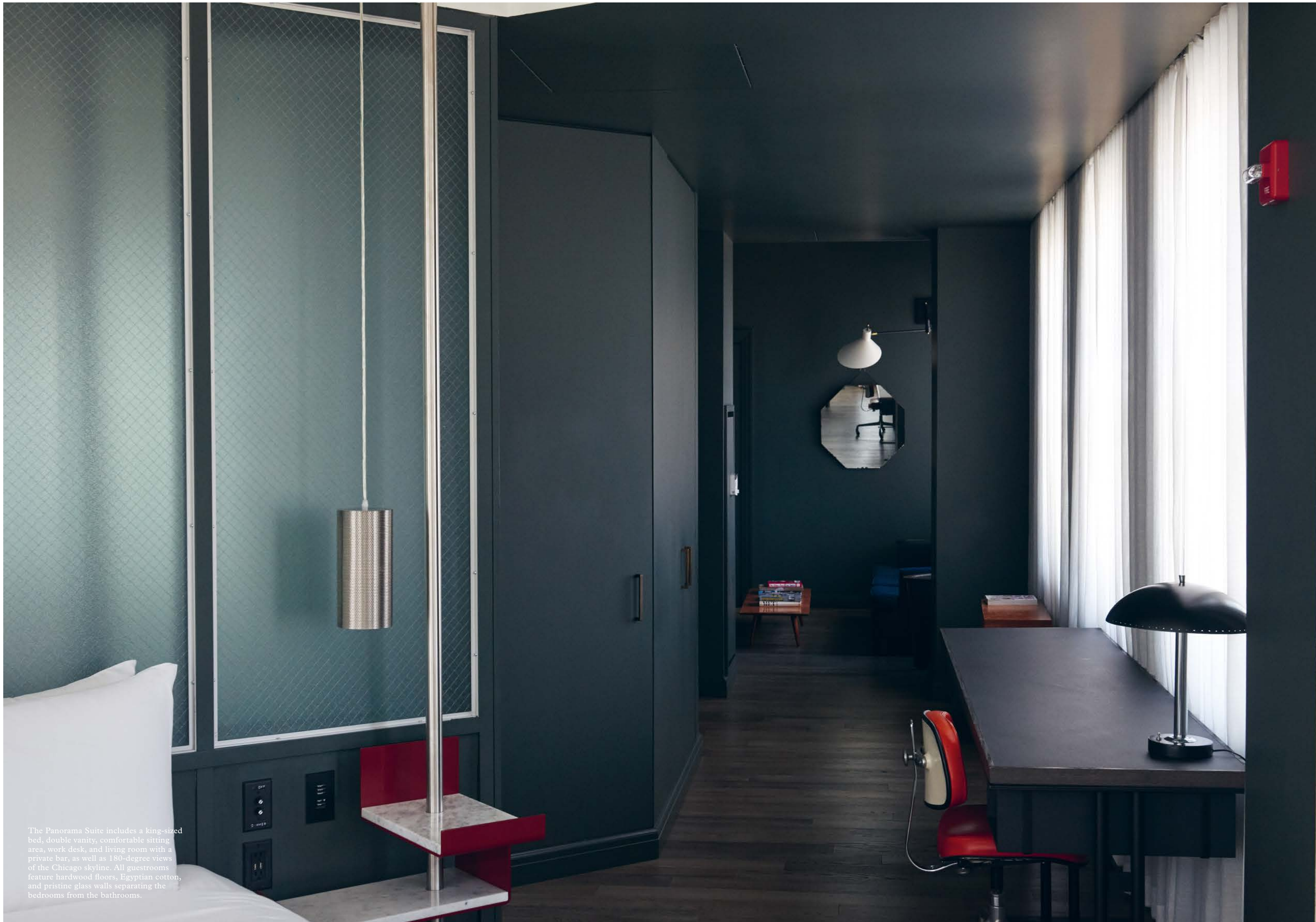
The Panorama Suite includes a king-sized bed, double vanity, comfortable sitting area, work desk, and living room with a private bar, as well as 180-degree views of the Chicago skyline. All guestrooms feature hardwood floors, Egyptian cotton, and pristine glass walls separating the bedrooms from the bathrooms.