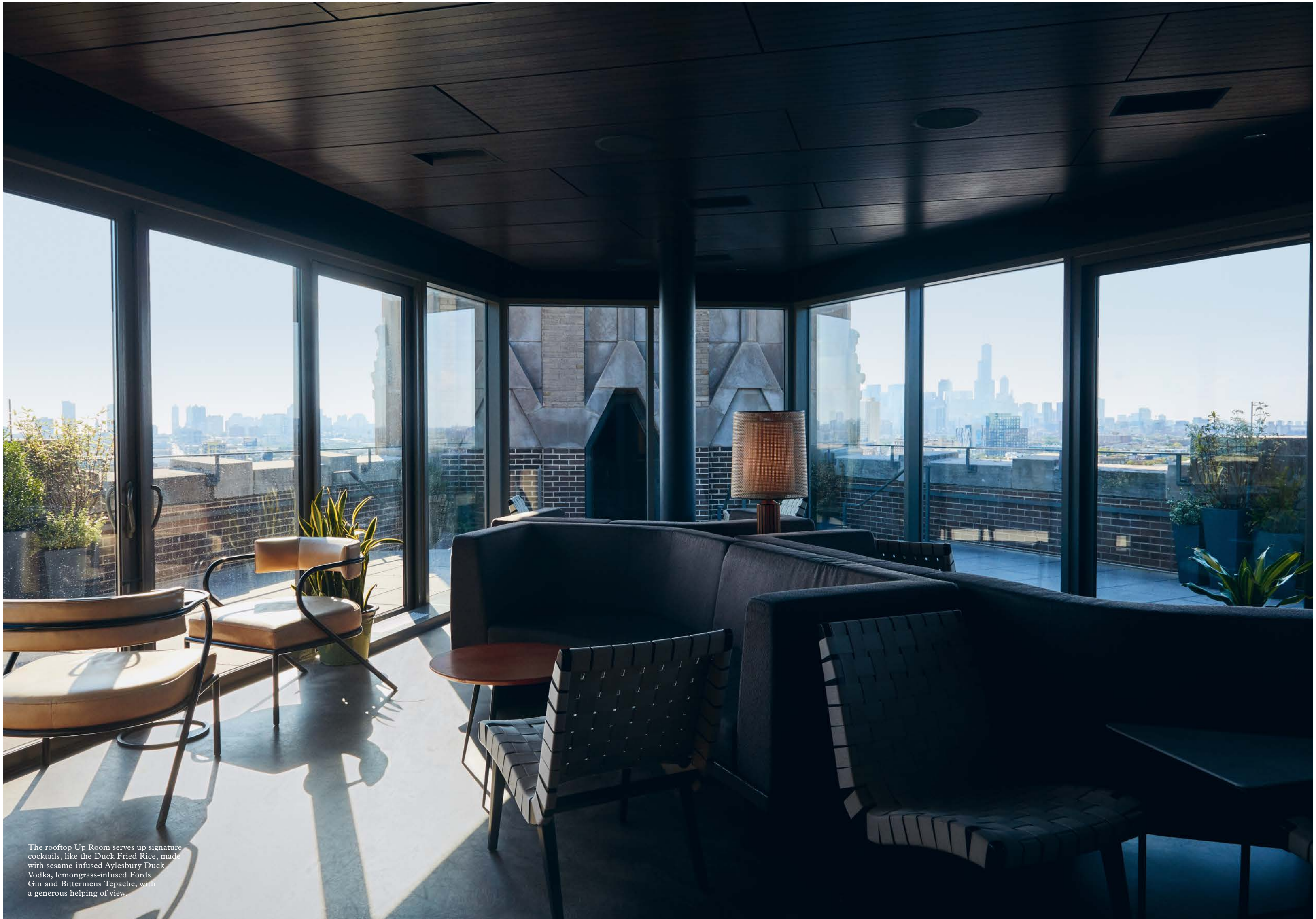
The rooftop Up Room serves up signature cocktails, like the Duck Fried Rice, made with sesame-infused Aylesbury Duck Vodka, lemongrass-infused Fords Gin and Bittermens Tepache, with a generous helping of view.